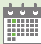
I ia 3 wiki, i ia 6 wiki rānei, i runga anō i te āhua o te pota ka tukuna ki a koe